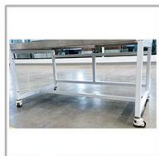
Base Stand Optional